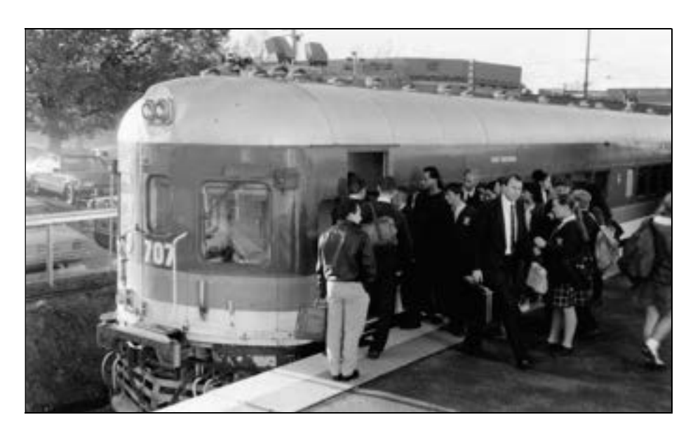
1991. Morning commuters changing trains at Riverstone.

In 1992, the power supply was upgraded, and the Richmond line was fully integrated into the Sydney Metropolitan system. Passengers no longer needed to change trains at Richmond. The small "dock" section of track was filled in and became part of the commuter car park.