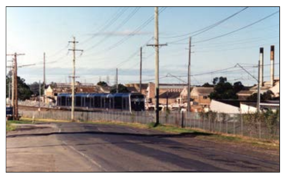
18 June 1995. A four car Tangara train passing the former Meatworks site.

Full electrification brought a more reliable train service for commuters on the Richmond Line. The final significant upgrade for travellers came with the introduction of the Eight car Waratah Class train sets which are all airconditioned.