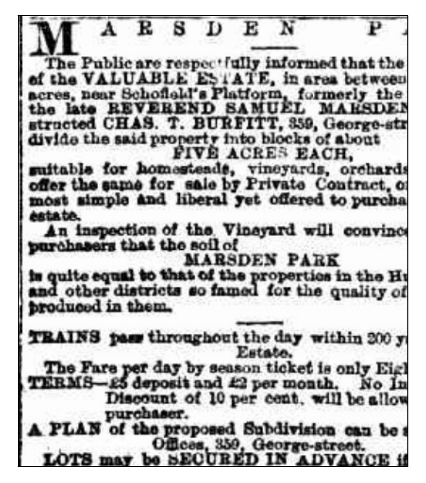
The Evening News, 3 November 1882.

Note as the terms of sale differ, the advertisement may not match the subdivision plan.